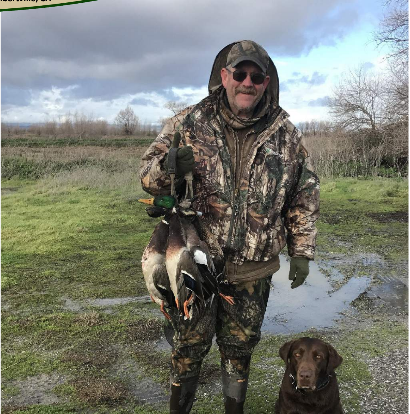
Another Great Hunt at the Slippery 6!

63.43+/- Acres Duck Club Lambertville, CA