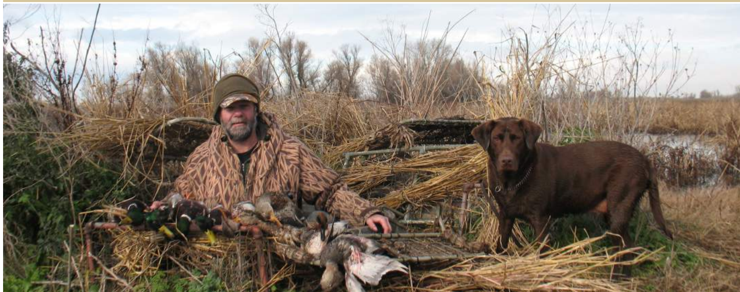
This poor dog can't figure out why he was only able to retrieve 7 ducks!