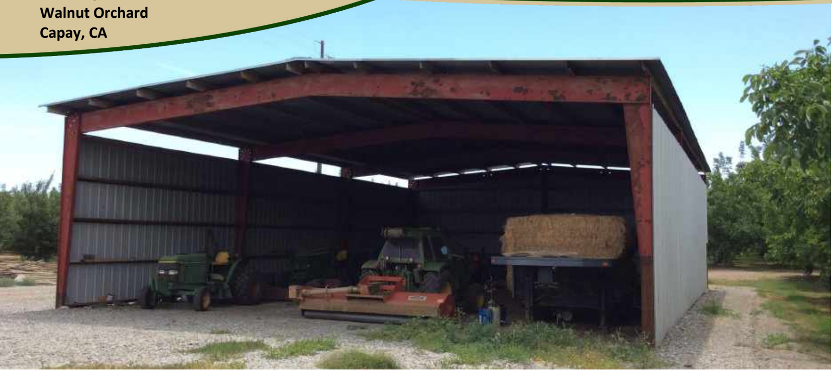
50 x 80 Equipment Storage Shed

116.96+/- Acres Walnut Orchard Capay, CA