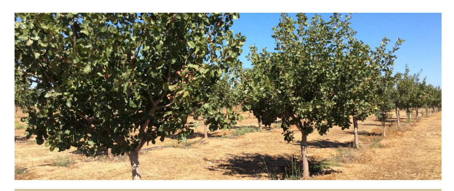
New Growth On Young Trees