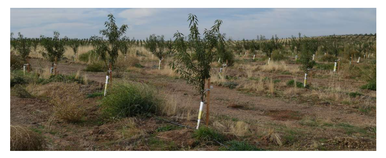
Well With Filters & VFD